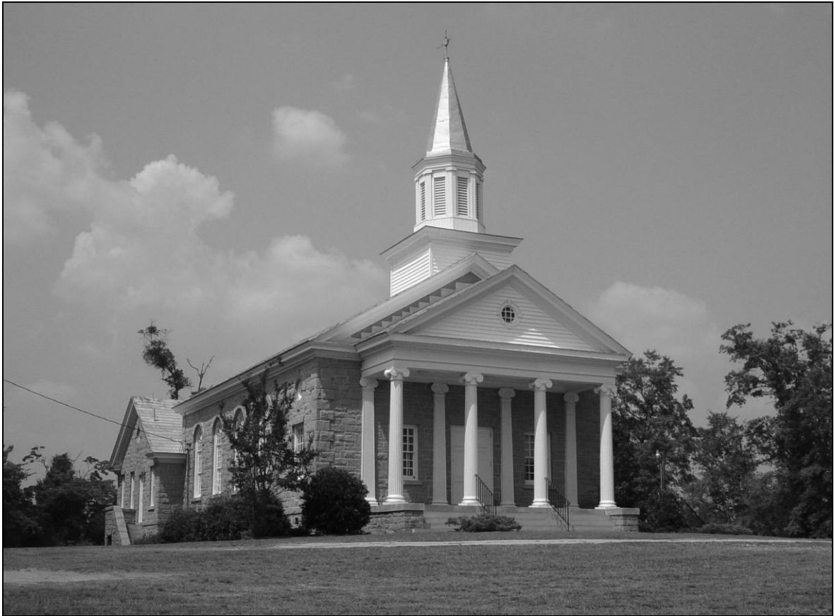
Union Memorial Presbyterian Church

(Church Cemeteries in the Western Section of the County)